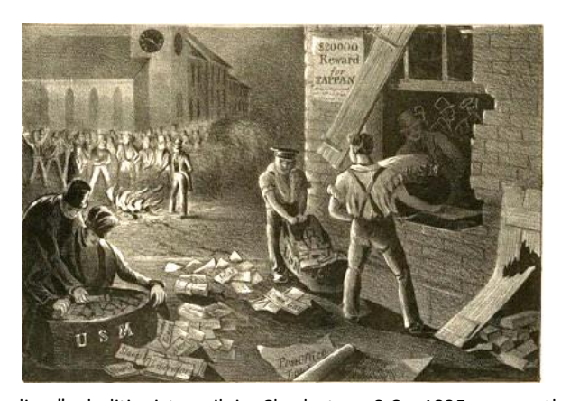
Burning "incendiary" abolitionist mail in Charleston, S.C., 1835, a month after one of Charleston's many great fires.

As if to show how incendiary the antislavery mailings were, a vigilance society in Charleston, the Lynch Men, stole them from the post office and made a bonfire. Two thousand whites—roughly a seventh of the city's white population—watched the materials burn, along with effigies of three leading abolitionists. Perhaps they meant this as payback for the conflagration they'd suffered a month before, attributed widely to Black arson.<sup>55</sup>