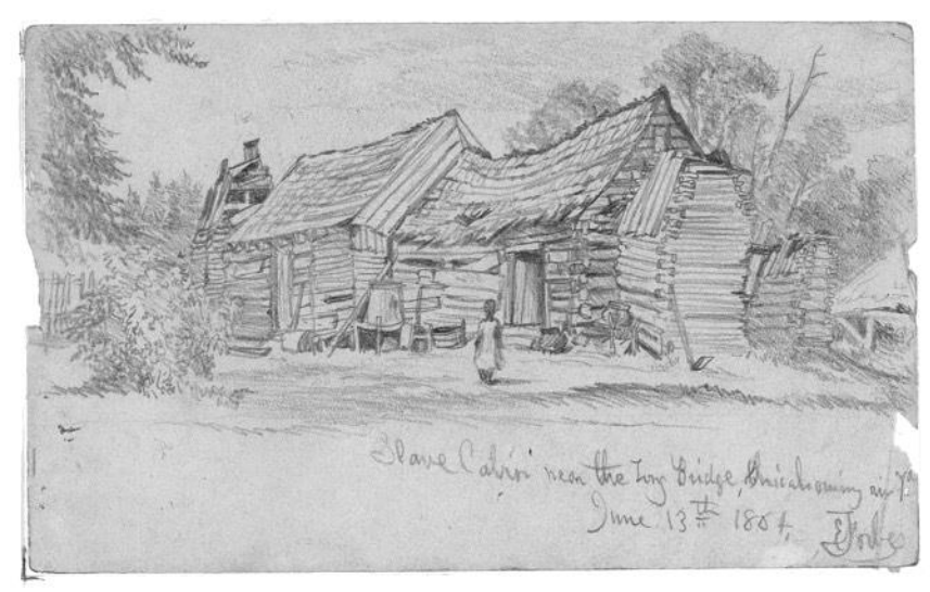
Wood is King: Edwin Forbes's 1864 sketch of a Virginia slave cabin captures the unrelenting woodenness of its architecture, material culture, and environment.

The reverse of this wooden coin was fire. Although "great fires" take center stage in urban histories, we rarely step back to consider how frequently things burned down in the United States and its colonial antecedents. It was a land, as Jill Lepore has written, where "daily life was a fire hazard." The White House famously caught fire in 1814, and, by the end of 1865, so had the original President's House in Philadelphia, Mount Vernon, Monticello, the Hermitage, the Confederacy's White House, the Smithsonian, the Patent Office, the Treasury, the War Department, P. T. Barnum's American Museum, and the New York Stock Exchange. By then, two-thirds of states had suffered fires in their capitols or former capitols and four states had watched their capitols burn down multiple times (counting territorial and colonial capitols). The U.S. Capitol in Washington caught fire twice, the second time requiring the president himself, Millard Fillmore, to work the engines to extinguish the flames. (Perhaps it helped that Fillmore had directed a fire insurance company back in Buffalo.)10