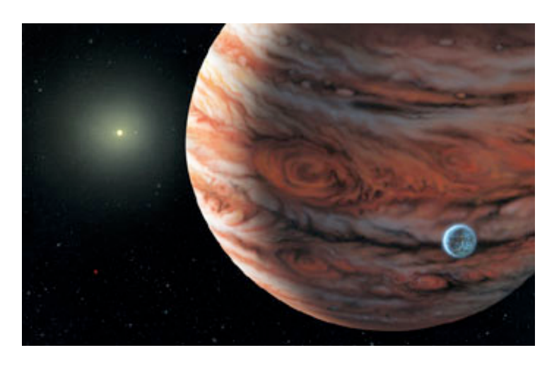
Jupiter may act as our solar system's "junk yard dog," protecting the Earth from comets. <u>Credit and Larger Version</u>

New computer simulations put solar system in universal perspective