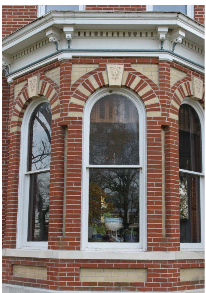
A grand stairwell greets visitors at the end of the front hallway. Window arches feature alternating beige and red bricks with cut-stone keystones with elaborate incised design. Beige bricks are also used to great effect in the front projecting bay windows in the form of recessed panels and spandrels that add richness to the window treatment.

Jackson Downing. What came out the other end was a whole Italian hilltown visually morphed into one picturesque house--the ubiquitous Italian Villa, popular in England and America.