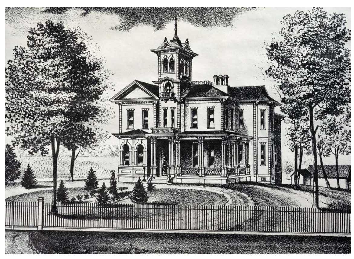
An artist's sketch of the Thomson house that appeared in the 1876 Illustrated Atlas Map of Howard Countly, when the house was brand new. Image courtesy of Jim Denny

In the instance of the Thomson house, the central tower is flanked by a forward-facing wing with a distinctive classical triangular-shaped pediment lined by dentils. This motif is repeated in smaller scale on the cornice of the hip-roofed tower, which is punctuated by centered small pediments on all four sides. Another cornice-like molding separates the third and fourth stories of the tower and also has pediment-like peaks on each side. The house is laid out on a rambling plan with a large projecting wing