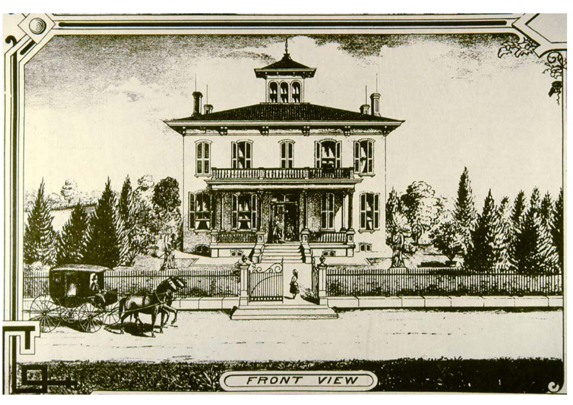
Glen Eden, Benjamin Lewis's impressive Italianate-style home built between 1858-62, was featured in the 1876 Illustrated Atlas Map of Howard County. This sketch shows the extensive Glen Eden grounds, along with the mansion as seen from the Missouri River and from the main road north out of Glasgow.

As impressive as the house itself was, the setting was spectacular. A full two-page spread of the 1876 Illustrated Atlas Map of Howard County, Missouri, shows views of the extensive Glen Eden grounds, along with the mansion as seen from the Missouri River and from the main road north out of Glasgow. The mansion sat within a wooded park where a wide variety of trees was planted. A driveway bordered by an iron fence approached the house from the main road and swung around the side of the house to reach the main entrance. Before doing so, the driveway