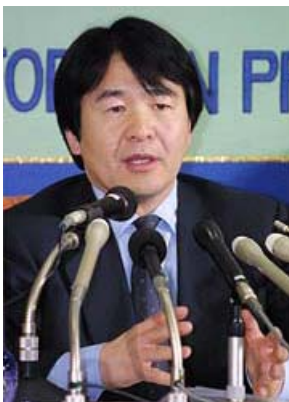
Takenaka implies "sell"

Japanese unemployment is at an historical high of 5.5%. On top of this, there is believed to be much hidden unemployment across the economy. The actions taken so far seem to have had little effect. Japanese consumers have refused to increase