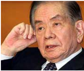
Hayami has his doubts

The dilemma facing Japan is that a weak yen could create as many problems as it solves. It is not clear that it would stimulate demand any more than low interest rates did. Morgan Stanley, an investment bank, estimates that demand for Japanese products is remarkably inelastic, meaning that the yen might have to fall to ¥200 to the dollar to stimulate national income by as little as 1%. And that assumes that the currencies of its trading partners do not decline too. Most Asian currencies look cheap against the yen, but a devaluation on this scale would be far more likely to trigger other devaluations across the region.