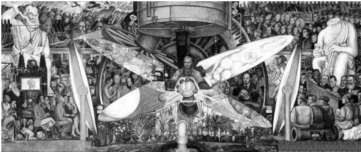
Figure 8. Diego Rivera, 'Man at the Crossroads,' Palacio de Bellas Artes, Mexico City, 1934.

Rivera finished the mural and was paid for his labors but it never went on public display. Incensed by Rivera's addition of a portrait of Lenin to its composition (in a way that fits with Gellert's view of Lenin as a Promethean figure), and unable to get Rivera to agree to modify the work to his satisfaction, Rockefeller chose to have the mural removed. Since it was produced in true fresco, removal