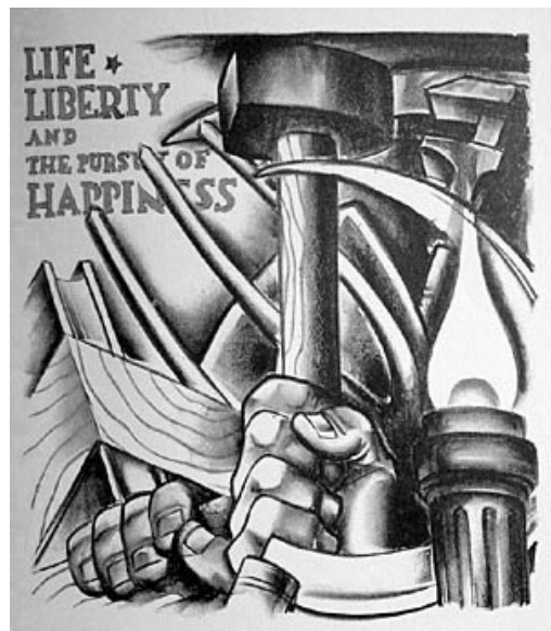
Figure 5. Hugo Gellert, 'Farm-Labor Party (The Bundle of Sticks),' Aesop Said So (New York: Covici Friede Publishers, 1936).