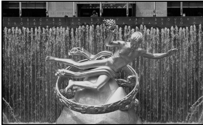
Figure 6. Paul Manship, Prometheus, Rockefeller Center, NY, USA, 1933.

marble wall behind the statue was a quotation from the tragedian Aeschylus that reads, 'Prometheus, teacher in every art, brought the fire that hath proved to mortals a means to mighty ends.'