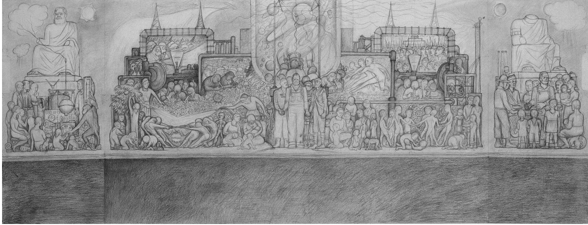
Figure 7. Diego Rivera, Preliminary Design for 'Man at the Crossroads.' Pencil on Paper. November 1932. The Museum of Modern Art, NY.